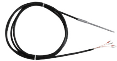
Lead wire type